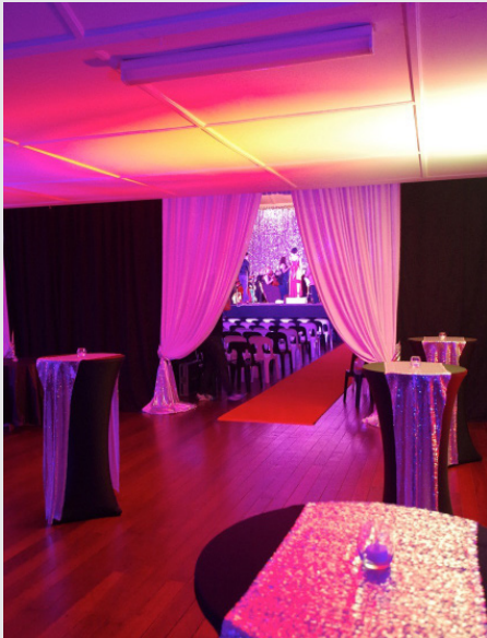
Guests arrived through the traditional front entrance of the nostalgic hall and were treated by a red carpet reception.