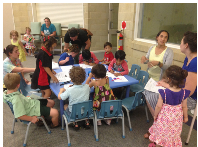
Start of 2016