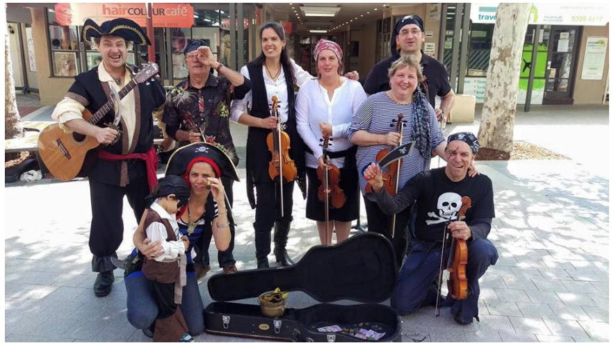
September 2015 Talk Like a Pirate Day ... "Aarrhrrrrrrh..."

both morale and long-term memory. It brought great pleasure to fiddle group musicians to this year share their music with residents at Seaforth Gardens, and then at the high-care branch at Dale Cottages. On this day, we had stacks of fun celebrating Saint Patrick's day.