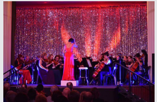
Dazzled audiences enjoyed revival of live music from CSO at Bringing Back the Magic concerts July 10th and 11th 2015.