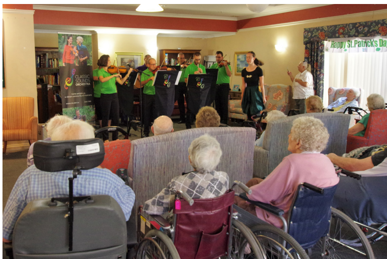
Celebrating Saint Patrick's day with residents at Dale Cottages 17th March 2016

A bad teacher can spoil your day A good teacher can change your life