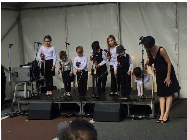
First ever performance - Minnowarra Festival May 2015