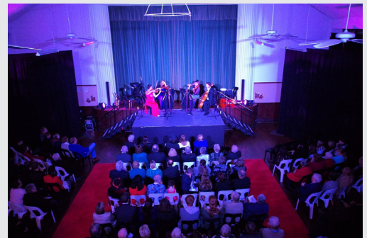
Classic Sounds String Quartet opened the second half of the show with the Tango, El Choclo

Don't only practice your art But force your way into its secrets For it and knowledge can Raise men to the divine. ~ Ludvig van Beethoven