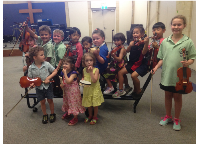
Start of rehearsals 2016

After its inaugural year, the Twinkle Stars class has now established itself as a really fun weekly session for children to learn about music. We sing songs and do actions, listen to different styles of music, learn about rhythm, as well as learn to read music and write words through colourful worksheets. All these fun activities ensure the children are making friends and learning special musical skills that pave the way to become great little musicians. Through activities and using words and phrases we are now playing rhythmic tunes on our violins. "Super cute" is an understatement, and all children leave the session with a bright smile.