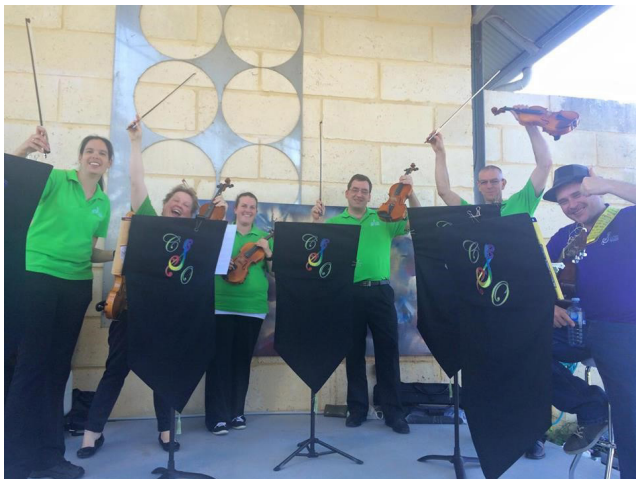
Celebrating Science Week at the Gingin Gravity Centre August 2015