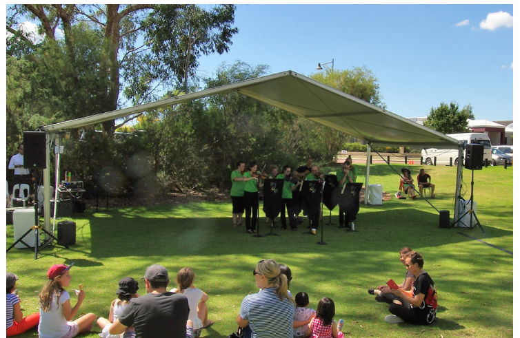
Harmony Day Festival March 2016