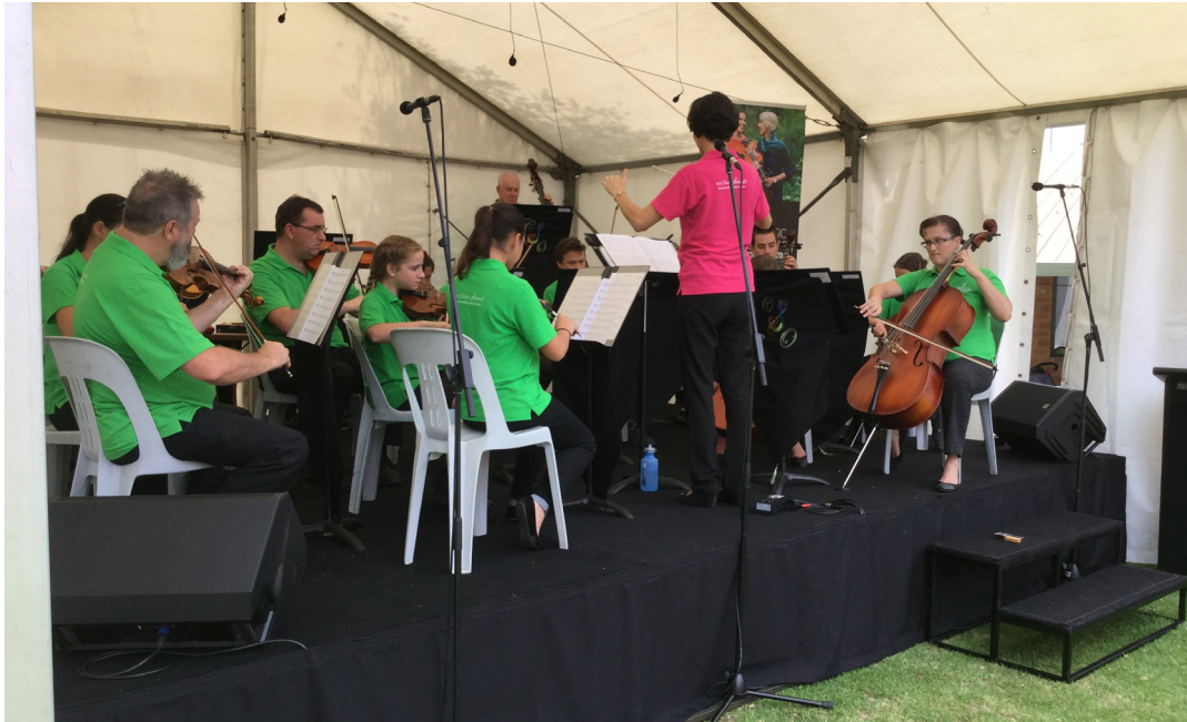
Hills Heartbeat 2015